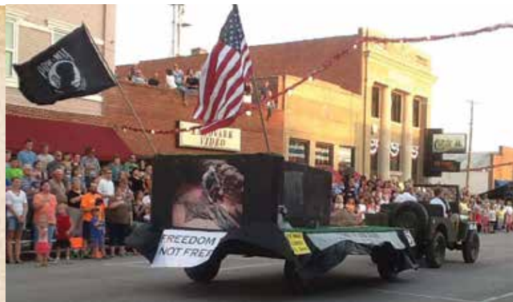
Above picture is a sample only of the type of float we would like to build to announce our date for the Moving Wall.

Also, we will need cooks for the hamburgers, brats, dogs and corn. We also need servers and bartenders and those who can sell our annual raffle tickets and lottery tickets. The fireworks start at about 9:15 p.m. and the parking lot fills up fast and we need help in collecting fees and parking cars. If you have some time on your hands, come and give us a